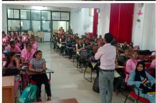
Theory sessions delivered by resource person