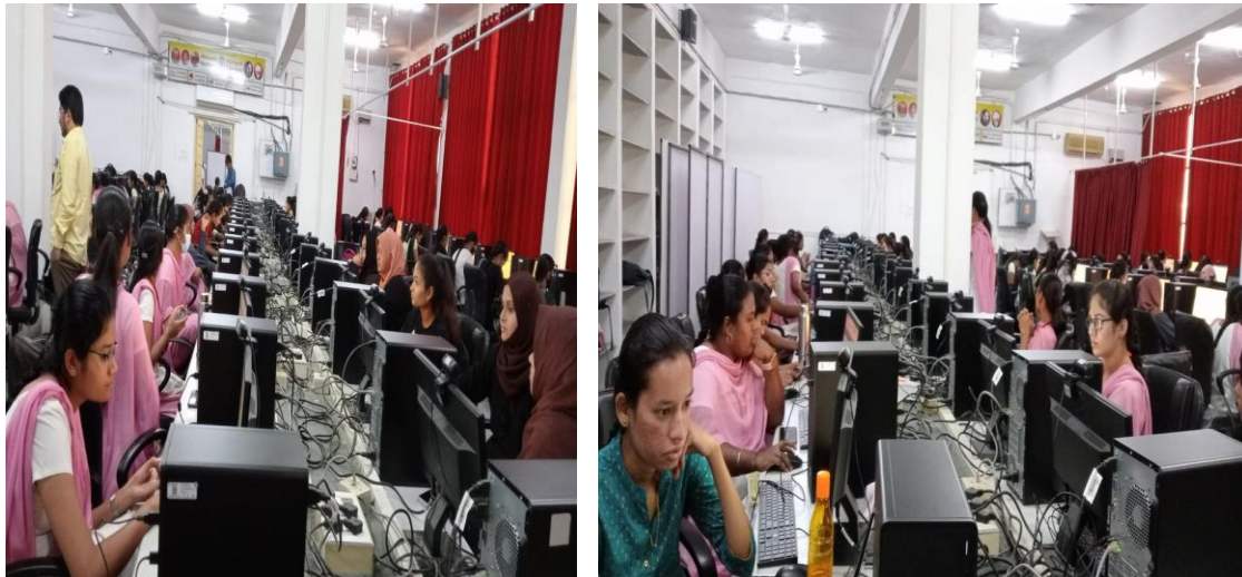
Lab Sessions conducted for students

On the fifth day, students explored the fundamental aspects of user interface development in Salesforce, focusing on Visualforce, Lightning Experience, and Lightning Web Components (LWC).