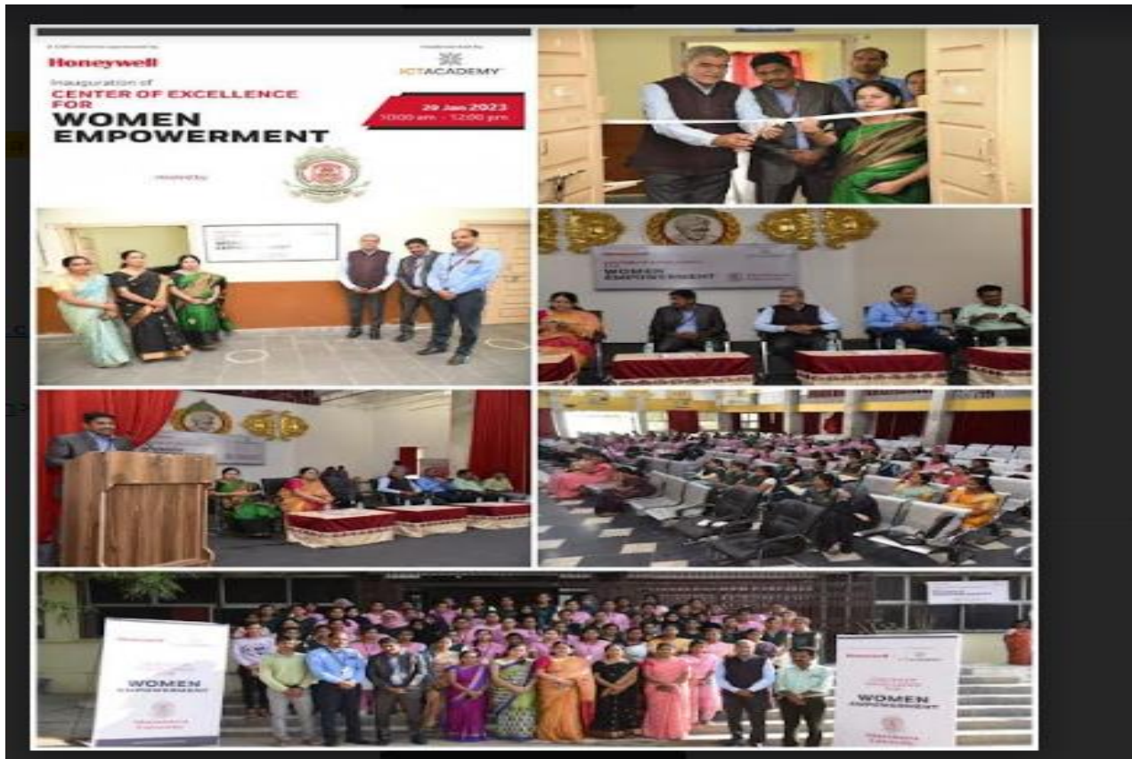
Honeywell Inauguration of COE for Women Empowerment