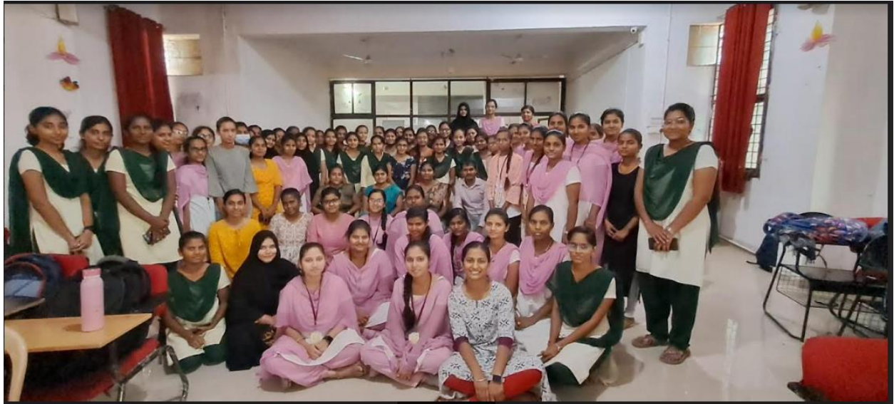
Students and Mentors during Valedictory